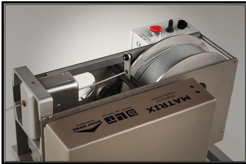
MATRIX PORTABLE DIGITAL LOGGER

The Mount Sopris Matrix Portable Digital Logging System can be used to collect quantitative (when calibrated) density information of the material surrounding cement pile access tubes. Plots, graphing density in lbs/ft 3 , can be generated in real-time, and spreadsheet programs for analysis easily import the data. A 4-foot diameter pile, 100 feet deep, with eight, 2+ ID access tubes can be logged in less than 3 hours in normal conditions. These quick, reliable surveys help Engineers make decisions in the field, saving time and money for the client.